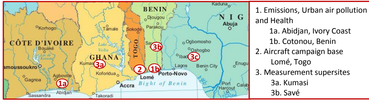
1. Basic package: Emissions, Urban Air Pollution and Health

Depending on the focus and length of the sequence we suggest a basic package and building on this three possible extensions. Internationally renowned atmospheric and health experts with media experience can provide interviews on various aspects of the project and field campaign.