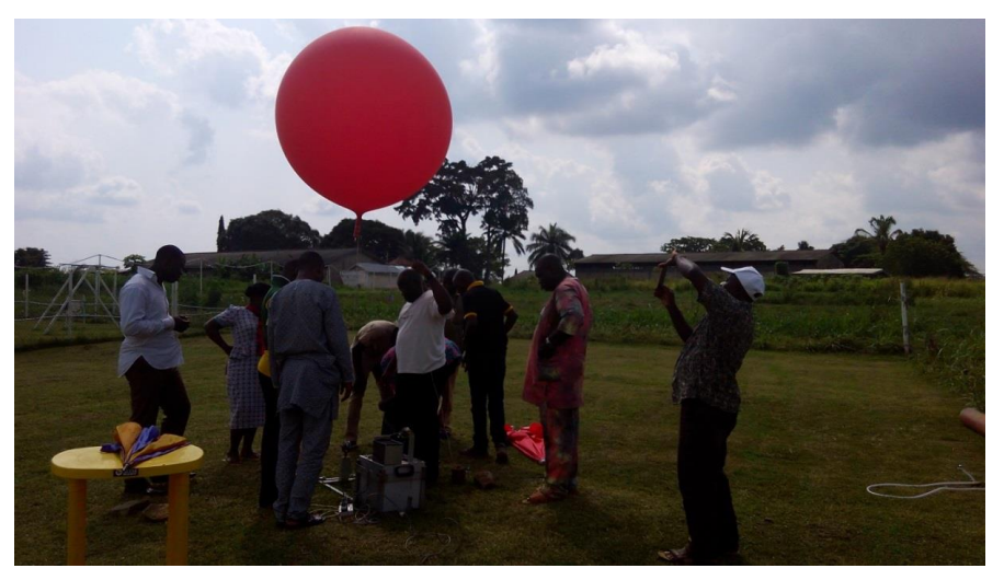
Figure 10: Demonstration of launch of a tethered balloon radiosonde system at the DACCIWA project site, OAU, Ile-Ife to scientific visitors from the Federal University of Akure and University of Ibadan on June 17, 2016.