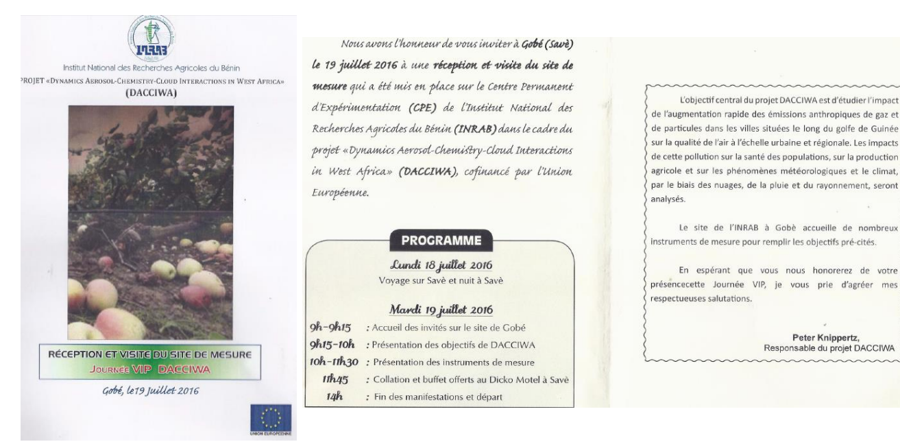
Figure 6: Invitation and agenda of the VIP day at Savé